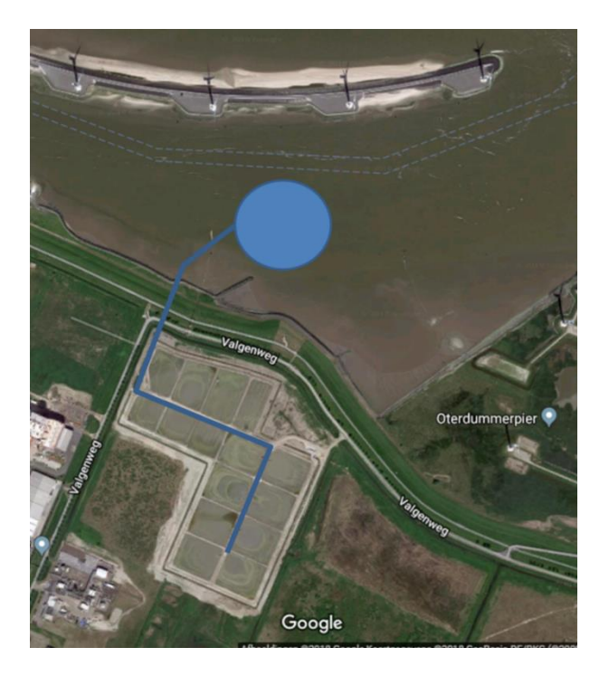
Figure 2. The Kleirijperij site of Delfzijl seen from Google maps about two months after deposition of the first layer. 15 cells are filled with dredged sediment coming from the entrance channel of the Delfzijl harbor (blue circle, approximate location) and transported directly to the cells with a pipeline (blue line).

Simultaneously, this pilot contributes to decreasing the turbidity of the Ems River and improving its water quality. The Kleirijperij pilot represents therefore an attractive win-win opportunity which harnesses BwN processes such as evaporation and consolidation and ripening, to turn excess dredged sediment into a resource, by creating clay soil for dikes.