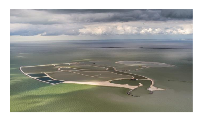
Figure 4: Aerial view of Marker Wadden under construction, April 2018. To the left of the the island, three smaller cells, where part of the KIMA research program will be executed.

Lake Marken in the center of the Netherlands is one of the largest freshwater lakes in Western Europe. Since the lake was artificially closed off from Lake IJssel, its ecological status has deteriorated severely due to a significant increase of the turbidity caused by re-suspension of fines. conservation The nature organization Natuurmonumenten and the Dutch government have joined forces with the ambition of improving the natural habitat in Lake Marken by decreasing suspended fines concentration. A potential strategy includes the excavation of deeper sediment traps that favor natural settling and sedimentation of fine particles and inflow of possible fluid mud. The trapped sediment can be utilized as part of the building material to create an archipelago of marsh islands: the so called Marker Wadden, which is intended to become a "bird paradise". The Marker Wadden intends to demonstrate that fine sediments can be used as a construction material for land reclamation, dike reinforcement and soil improvement. This ambition is in line with the Kleirijperij project described above, and therefore similar to turning FFT deposits into reclaimable landscape.