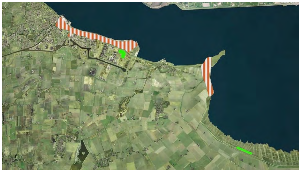
Figure 3. Locations for the Clay Ripening pilot project in the Province of Groningen (NL): near Termunten (Clay Ripening location Delfzijl) and on the salt march (Clay Ripening location Kwelder). The areas in red and white show where the sediment was collected (Zeehaven Kanaal and Breebaart polder); the green areas show the sections of the clay ripening site (Clay Ripening location Delfzijl and Clay Ripening location Kwelder).

As part of the ED2050 program, various pilots have been initiated and partially executed to explore the technical, financial and legal feasibility of various solutions to beneficially use Eems-Dollard sediments. Two of these applications include the use of ripened sediment as building material for dike reinforcement (Figure 3) and to raise low lying and still subsiding lands with high groundwater levels, increasing salinity and continuous oxidation of peat layers. In parallel to these pilots, the program VLOED, also under the ED2050 umbrella, was initiated with the main objective to assess the technical, economical, legal and governance feasibility to scale-up these two applications (sediment for dike reinforcement and for raising agricultural land) at a regional scale.