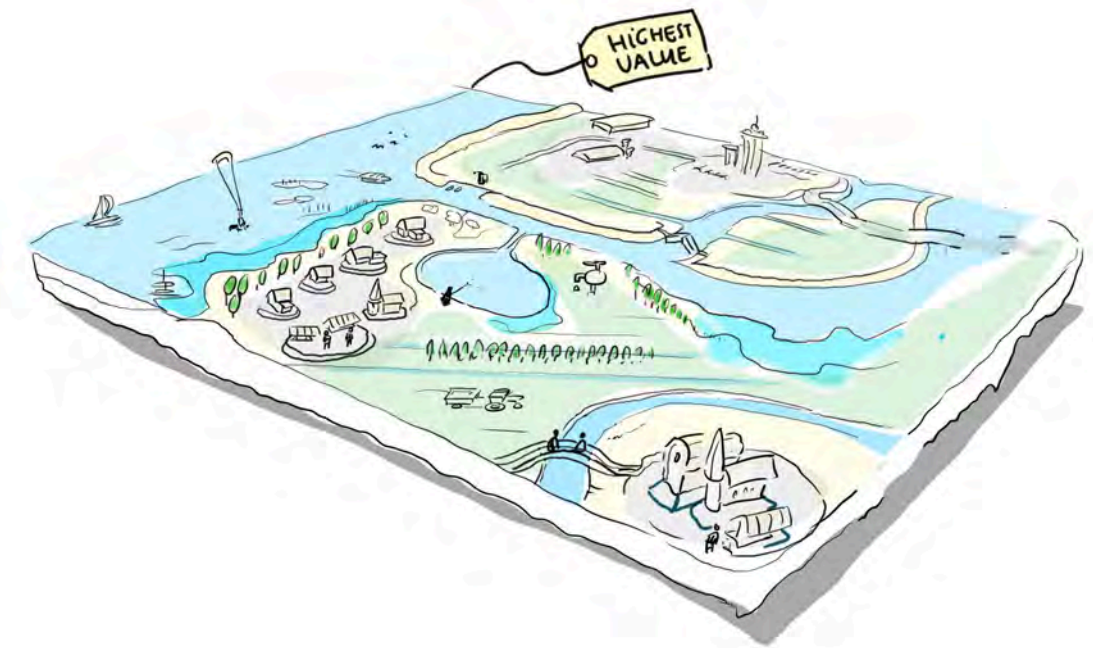
Figure 1. Visualization of a typical Dutch estuarine system landscape, with different assets and water providing a critical interconnecting role. ISBAM manages assets integrally, seeking for highest value for the area.

ISBAM results in sustainable and long-term benefits, which focus on connecting and fostering collaboration of responsible authorities and agencies in managing the overall combined performance of their assets, while refraining from the day-to-day asset management practice.