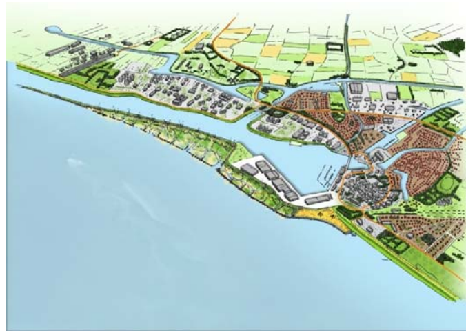
Figure 4. Artist impression of the proposed ecodynamic design at Delfzijl (Dankers et al., 2013).

In 2013, within the first Building with Nature program, an ecodynamic design for the Delfzijl area was made (Dankers et al., 2013), Figure 4. It comprises a new beach (spatial quality: recreation), a salt marsh park (spatial quality: recreation & nature, and flood safety) and a pioneer salt marsh zone (spatial quality: nature, and flood safety) that is expected to grow in due time towards a naturally functioning salt marsh. To also incorporate the economics of the area the idea was added to use the dredged material from the harbour for creating the new salt marshes and to reduce the sedimentation in the harbour area by adjusting the fresh water outflow from the hinterland. In this paper we elaborate on the specific BwN concepts that will be used in Delfzijl.