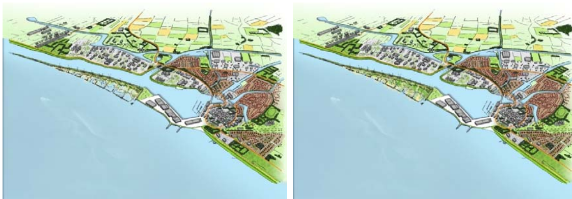
Figure 5. Proposed lay out of the pioneer salt marsh at the start (left, only pioneer zone) and expected size around 2060 (right, full range from pioneer zone to developed salt marsh) (Dankers et al, 2013).