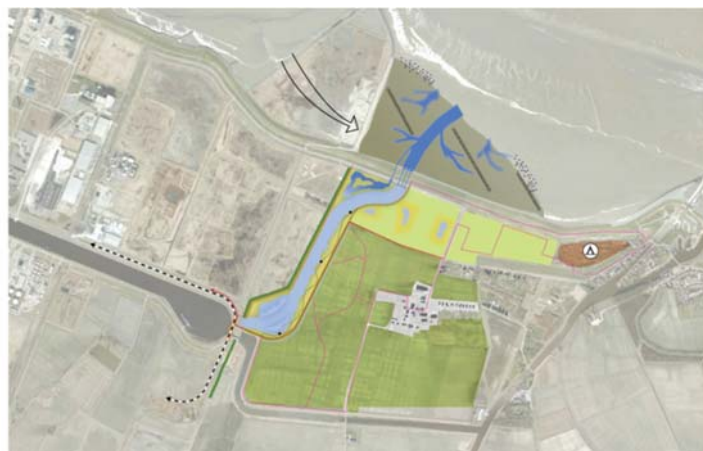
Figure 6. Proposed design of the fresh water outflow at Delfzijl including the development of an estuarine gradient with marshes (Verhoogt et al, 2014)

Another BwN concept that is incorporated in the Marconi Offshore project is creating estuarine gradients. In 2014 a study on the possible effects of moving the fresh water outflow from the harbour towards a more southern location was performed by the Ecoshape consortium (Verhoogt et al., 2014). The harbour of Delfzijl suffers from high sedimentation rates. This is enhanced, as it is in many harbours in the world, by the fresh water outflow that is situated in the harbour basin. Moving the fresh water outflow to a location outside the harbour basin may reduce the sedimentation rate. This also creates possibilities at the new location to form estuarine gradients. Estuarine gradients are important to support a healthy and sustainable estuarine ecosystem. The reconnaissance study (Verhoogt et al., 2014) showed that, despite the difficult spatial situation in the area with large petrochemical industry sites, an interesting design can be made that is favourable for the harbour (reduced sedimentation) and for the ecosystem in and around the estuary, while at the same time the industrial development is not hampered. The design incorporates a large wetland area that guides the fresh water flow towards the estuary and a fish passage with a brackish basin for migratory fish to find shelter and rest. The proposed design is shown in Figure 6.