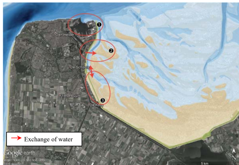
Figure 7. Project locations around the Port of Den Helder with (1) modification of entrance lay-out, (2) relocation of freshwater discharge towards Balgzand and (3) smooth fresh-saline gradient in Balgzand canal.

The positive effect on habitat suitability could be extended landwards by introducing a gradual transition between freshwater and seawater in the Balgzand canal. Fish migration would be strongly enhanced if salt water is allowed to flow landwards. As a first step, a pilot including monitoring would be required to determine whether fish migration does increase to the anticipated level and whether upwelling of brackish water in the vicinity of the Balgzand canal does not become problematic for farming.