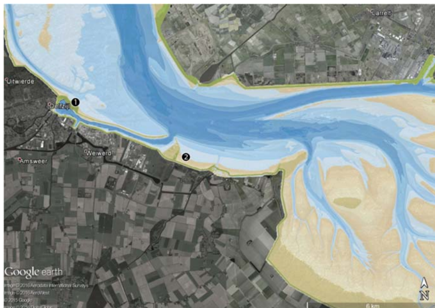
Figure 3. Overview of project location along the Ems-Dollard Estuary with (1) location of pioneer salt marsh and (2) location of fresh water outflow.