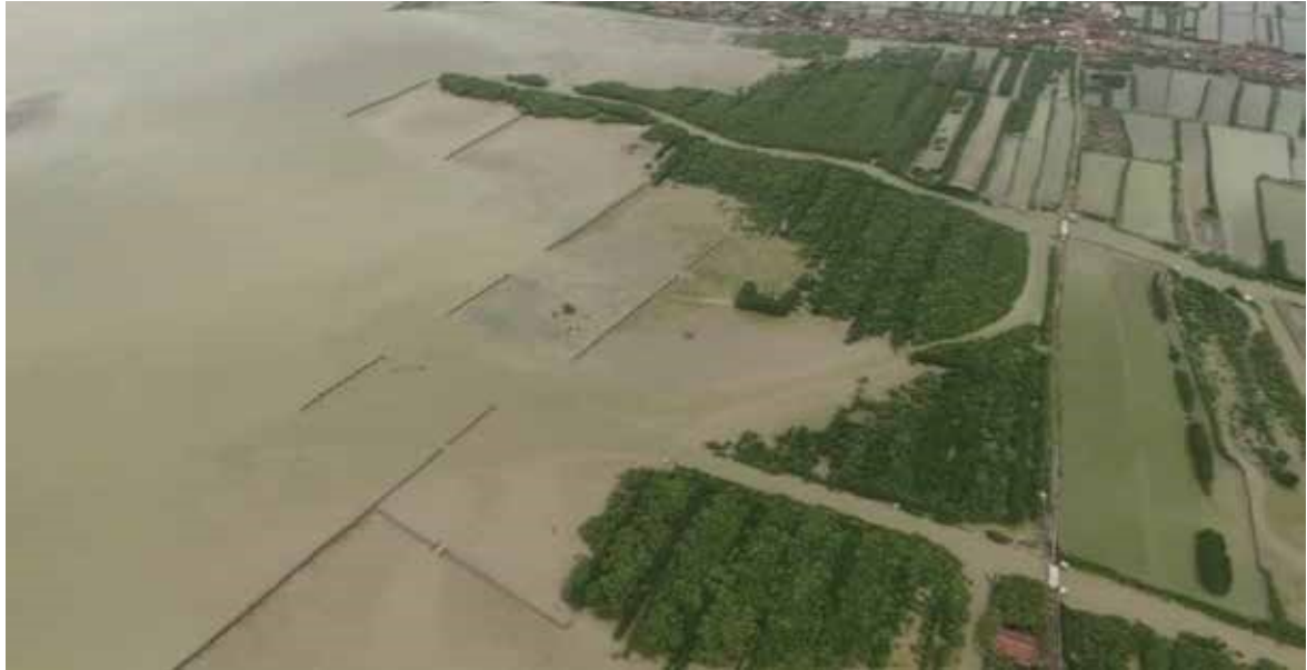
Figure 5. Aerial view of permeable dams at the pilot project location.