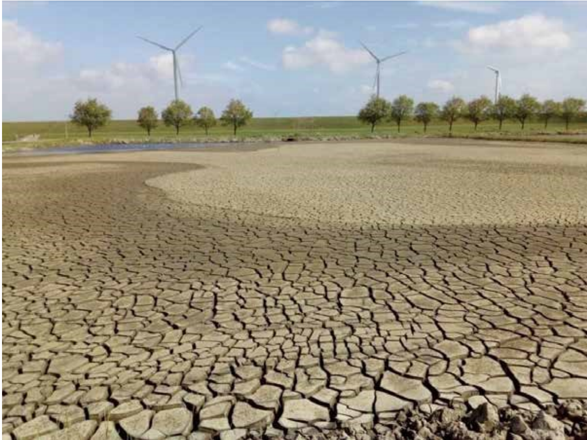
Figure 3. Image of one cell of the Kleirijperij taken on 16 th of August (day 135), therefore about one month after the second layer was deposited.

The Kleirijperij pilot is part of the broader Eems-Dollard 2050 program (see https://eemsdollard2050.nl/ for further information). The Kleirijperij is a collaboration between EcoShape, the Province of Groningen, the water authority 'Hunze en Aa's', the Delfzijl port authority Groningen Seaports, the nature organization Groninger Landschap and the Dutch Ministry of Infrastructure and Water Management. The project partially financed by the Waddenfonds and the Dutch National Flood Protection Program HWBP.