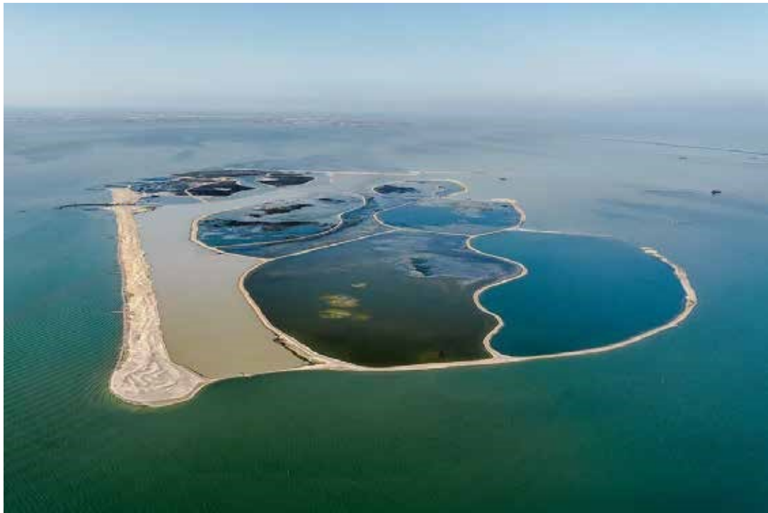
Figure 6. Aerial view of Marker Wadden under construction, April 2018.

Lake Marken in the center of the Netherlands is one of the largest freshwater lakes in Western Europe. Since the lake was closed off from Lake IJssel, the ecological situation has deteriorated severely because of the turbidity caused by fine sediments. The nature conservation organization Natuurmonumenten and the Dutch government have joined forces to improve the natural environment in Lake Marken by capturing silt from the lake and using it as building material for an archipelago of marsh islands (Figure 6). The islands are designed to be an attractive location for birds.