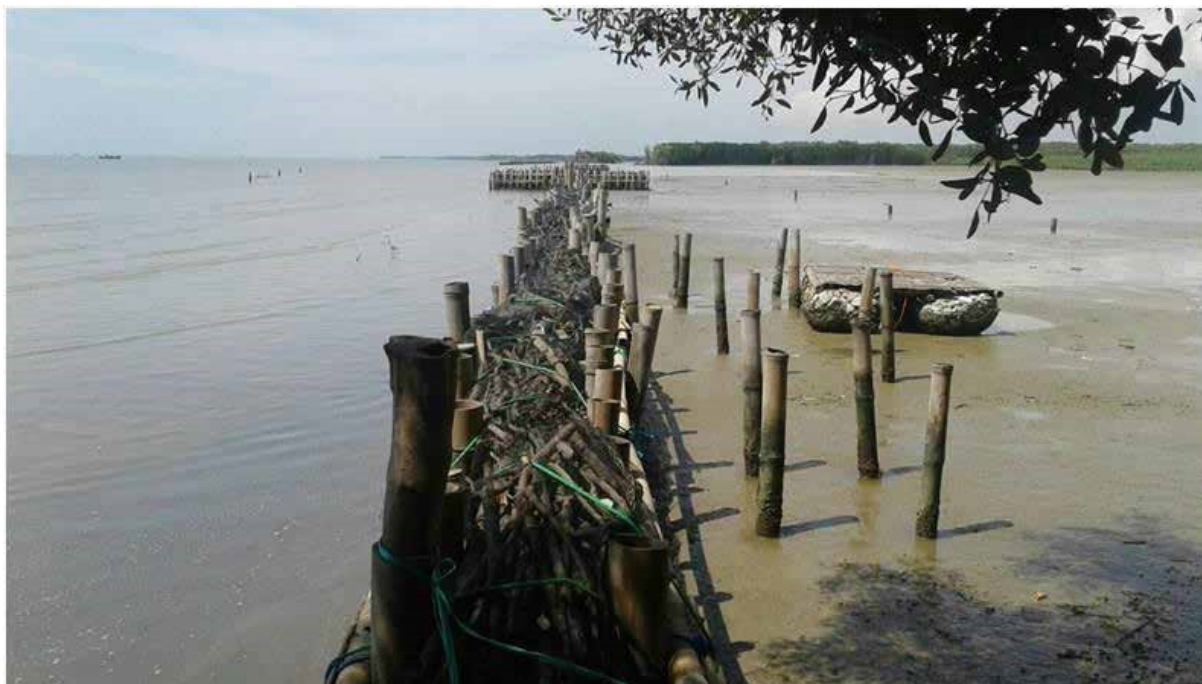
Figure 4. Sedimentation behind permeable dam constructions. Photo by Wetlands International.

Although the pilot project is only halfway, initial results show that by making use of relatively low-tech solutions, restoration of degraded muddy coasts is feasible. Furthermore, this pilot shows that social awareness is of utmost importance for sustainable coastal zone management and that communities and governments can be successfully mobilised. These insights contribute to delivering tools and building blocks to the overarching vision of the LLM development.